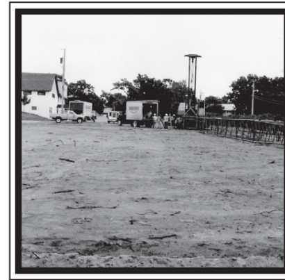
The original parking lot was installed on Wednesday, June 27, 1984 by H.L. Johnson Companies at a cost of $10,100.