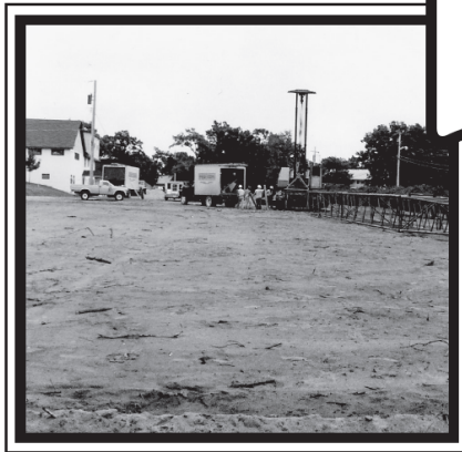
The original parking lot was installed on Wednesday, June 27, 1984 by H.L. Johnson Companies at a cost of $10,100.