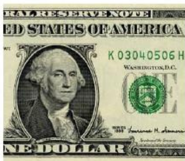
Board of Regents (Immanuel Lutheran College) 47 cents