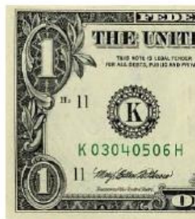
Board of Missions (foreign and domestic missions) 36 cents

budget the mission offerings for the various ministries that we have undertaken as a church body. The following shows how your mission dollar is currently being used (based on FY13 Budget set by the 2012 Convention):