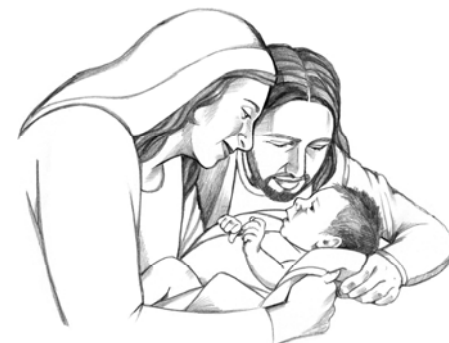
The Miracle of Christmas