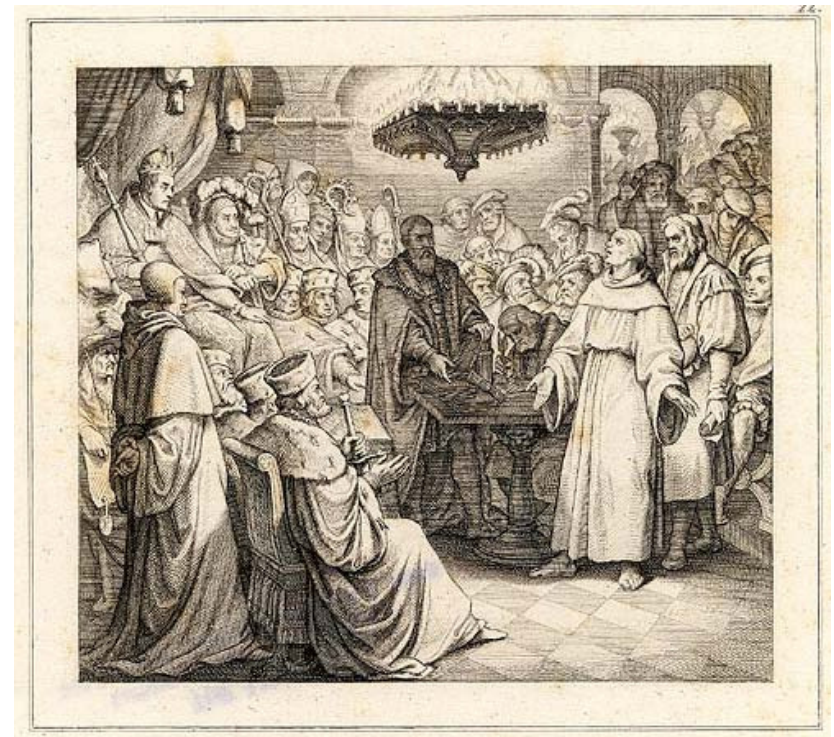
Martin Luther at the Diet of Worms (1521)