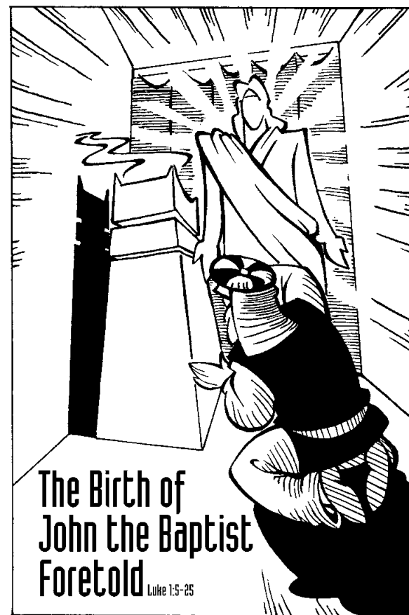
The Birth of John the Baptist Foretold