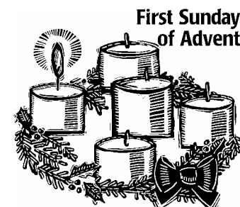
First Sunday of Advent

C: From the house of the Lord we bless You! Alleluia.